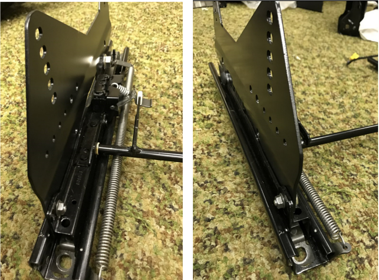
Mounted outside and bend out (widest possible position)

The two R-9052 side mounts are not the same, but either can be used on either slider. By switching which mount is used on which slider, 13mm of side mount width variance can be achieved. Additionally, the R-9052 side mounts can me mounted on either the inside or outside of the factory Porsche slider, allowing for 6mm of variance. (Note: the lowest sub strap mount position can only be used with the side mounts mounted outside of the slider).